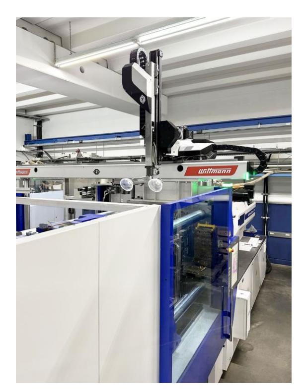
The Sonic high-speed robot has been specially developed for high-speed applications in the packaging industry.